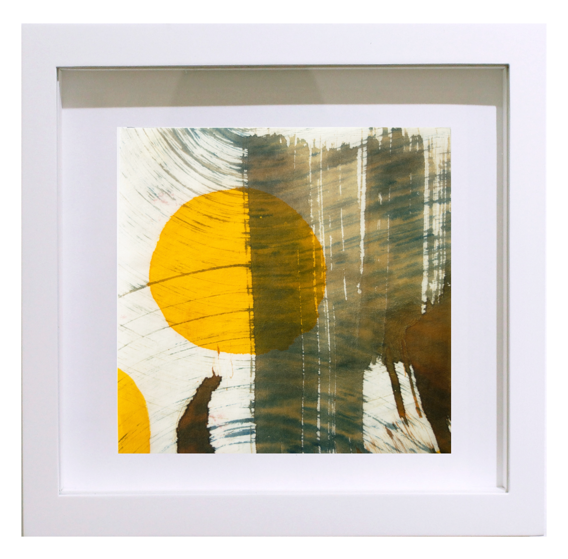
Solar, 2017, Flashe and graphite on Mylar, 8" x 8", $400