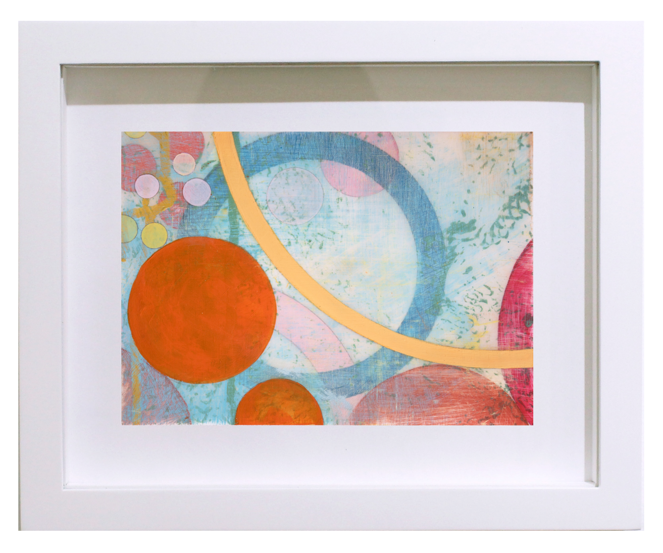
Swing, 2017, Flashe and graphite on Mylar, 5" x 7" $ 300