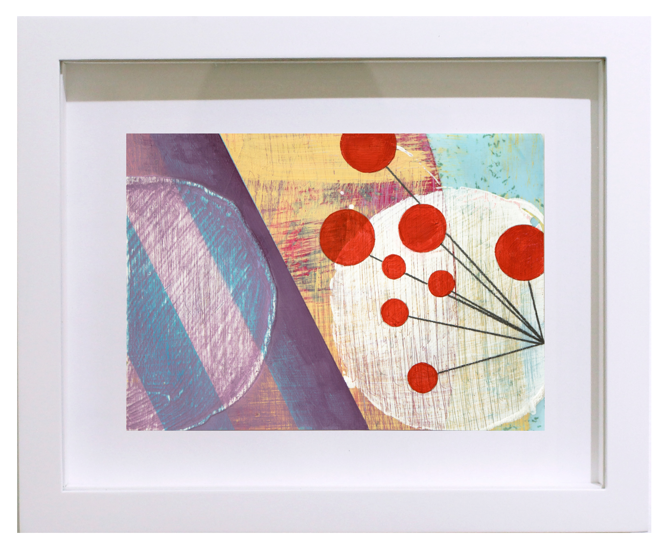
Plot, 2015, Flashe and graphite on Mylar, 5" x 7", $ 300