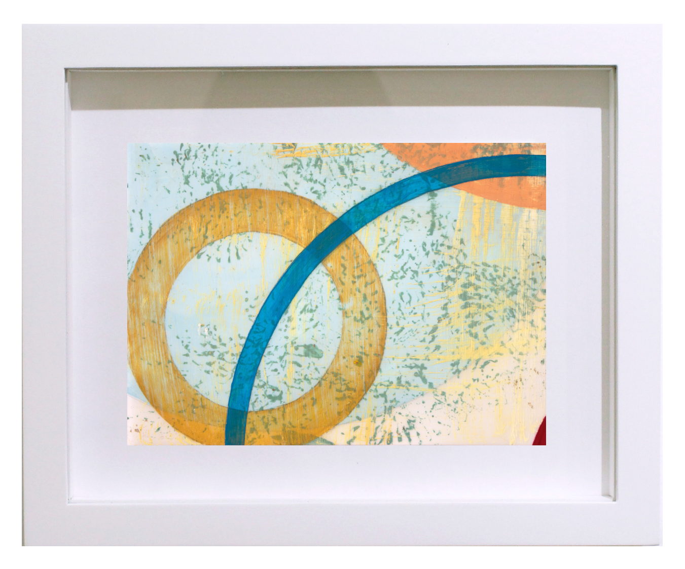
Arc, 2017, Flashe and graphite on Mylar, 5 " x 7" $ 300