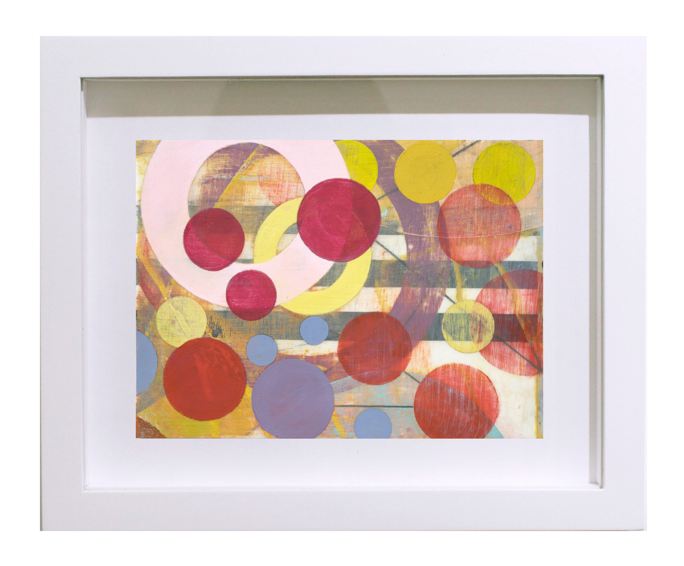
Consortium, 2017, Flashe and graphite on Mylar, 5.5 " x 7.5" $ 350