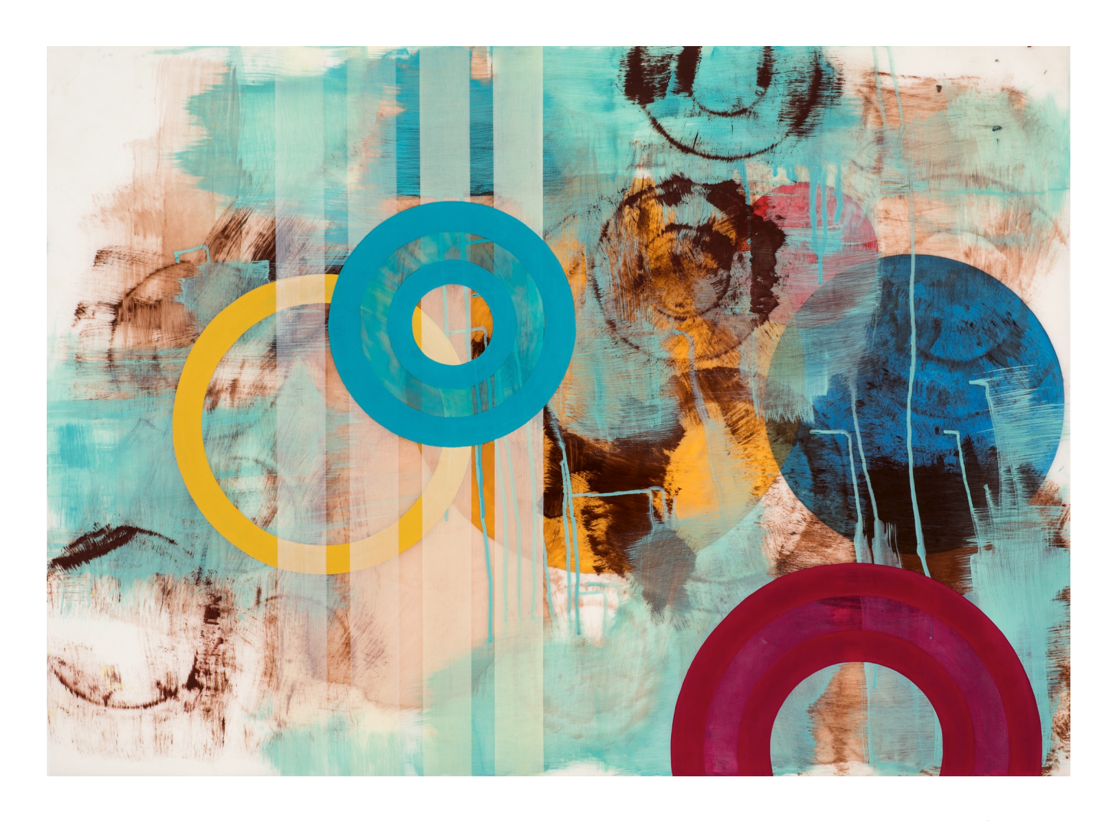
Blue Circle - White Stripes, 2014, Flashe on Mylar, 30 x 42 inches, $4,200