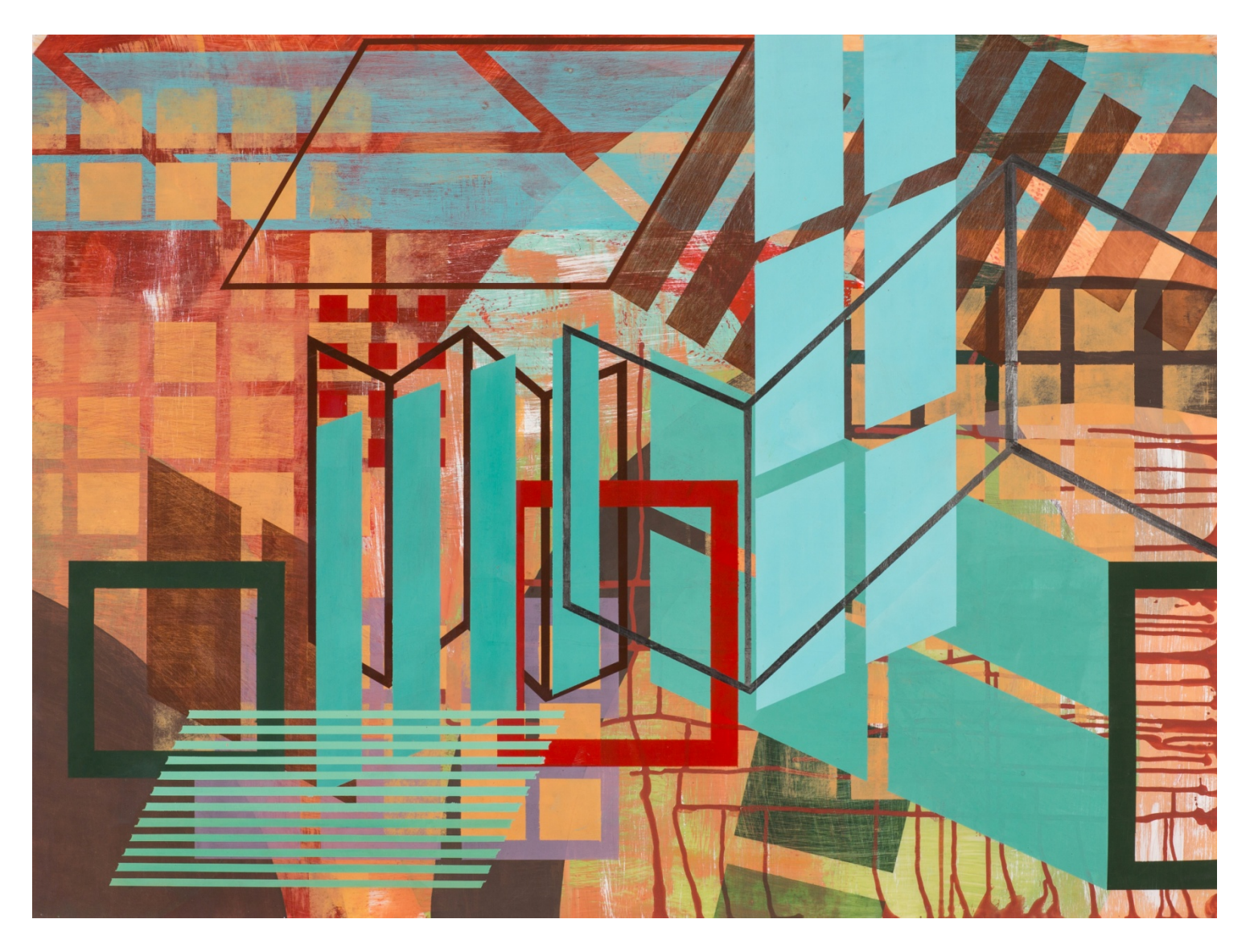
Big Steps, 2012, Flashe vinyl paint and graphite on Mylar, 30" x 40", $ 4,000