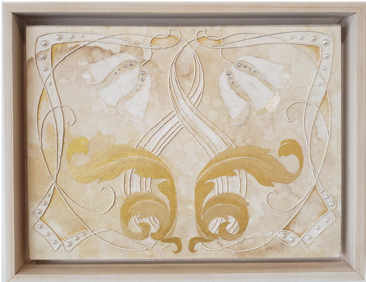
Emma Kim White Art Nouveau 1 with Mother of Pearl 2021 Korean Pigment with Mother of Pearl On Mulberry paper 9 x 12 inches $480