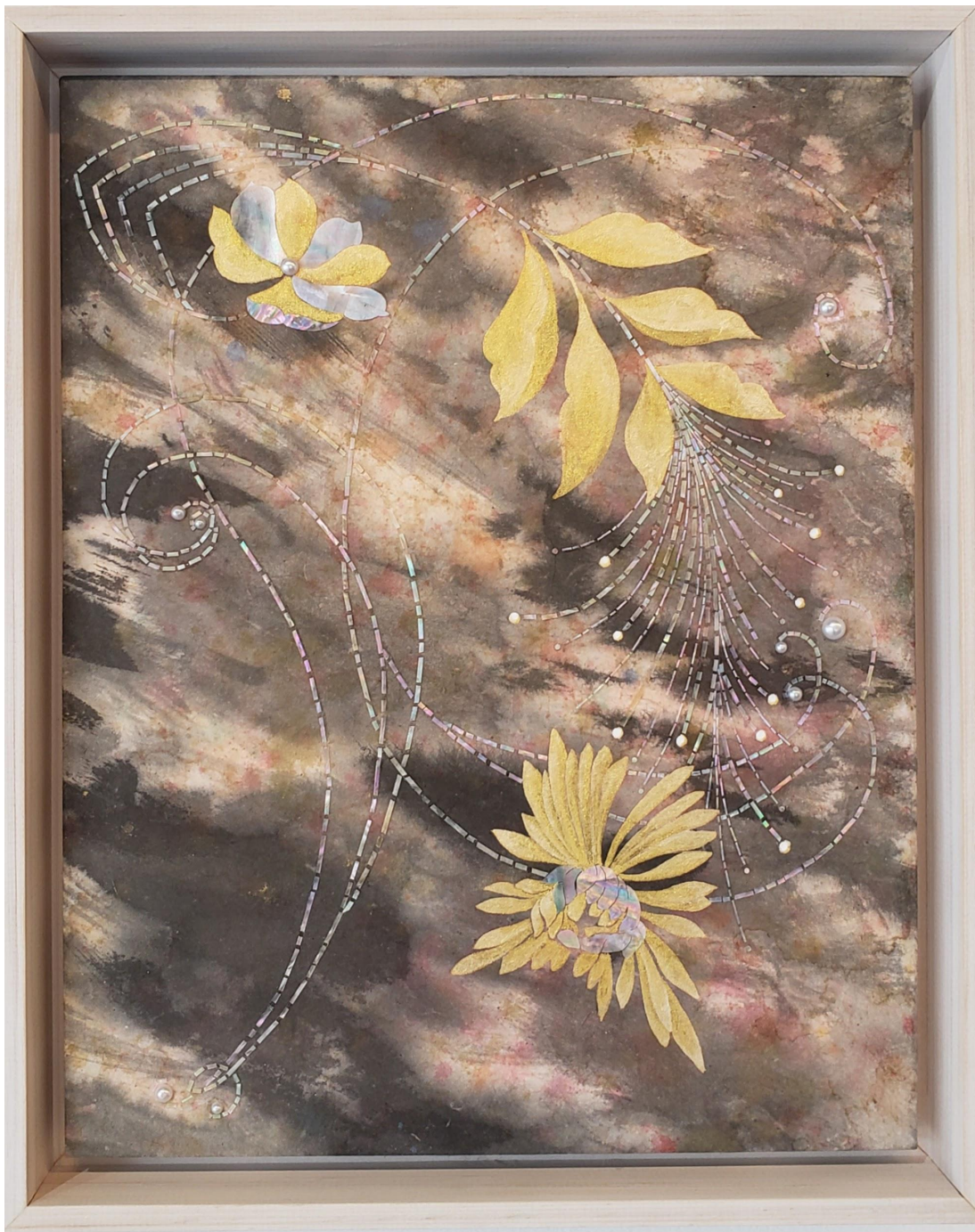
Emma Kim Black Art Nouveau 2 with Mother of Pearl 2021 Korean Pigment with Mother of Pearl On Mulberry paper 11 x 14 inches $520