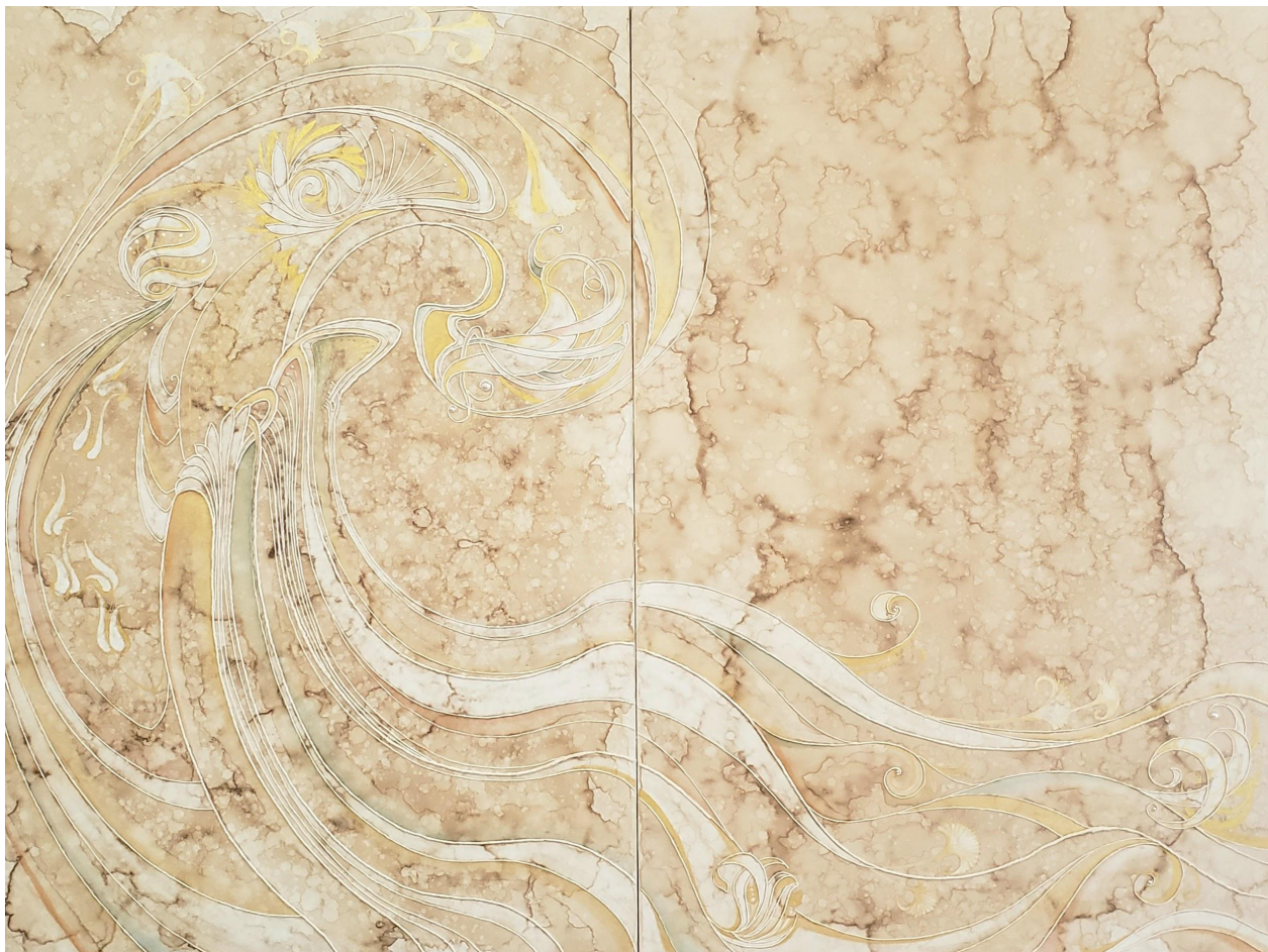
Emma Kim White Wave 2021 Korean Pigment with Mother of Pearl On Mulberry paper 48 x 36 inches $3,800