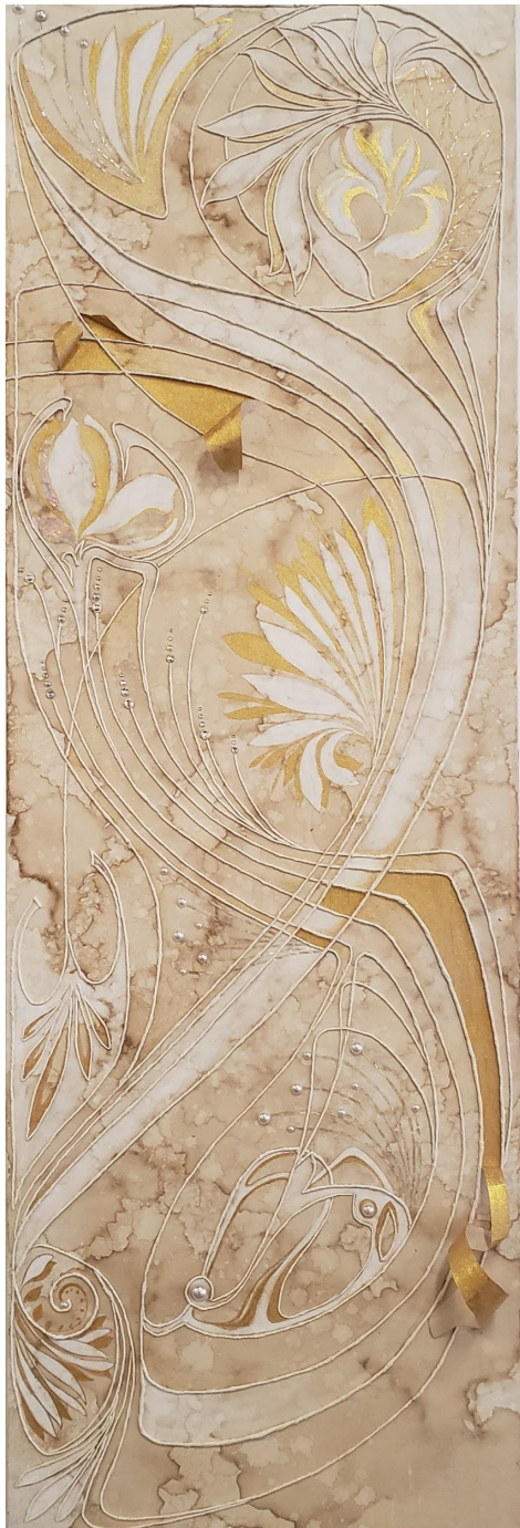
Emma Kim Gold Art Nouveau 2021 Korean Pigment with Mother of Pearl On Mulberry paper 12 x 36 inches $1,800