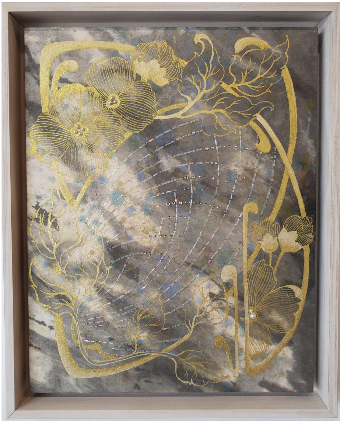
Emma Kim Black Art Nouveau 1 with Mother of Pearl 2021 Korean Pigment with Mother of Pearl On Mulberry paper 11 x 14 inches $520