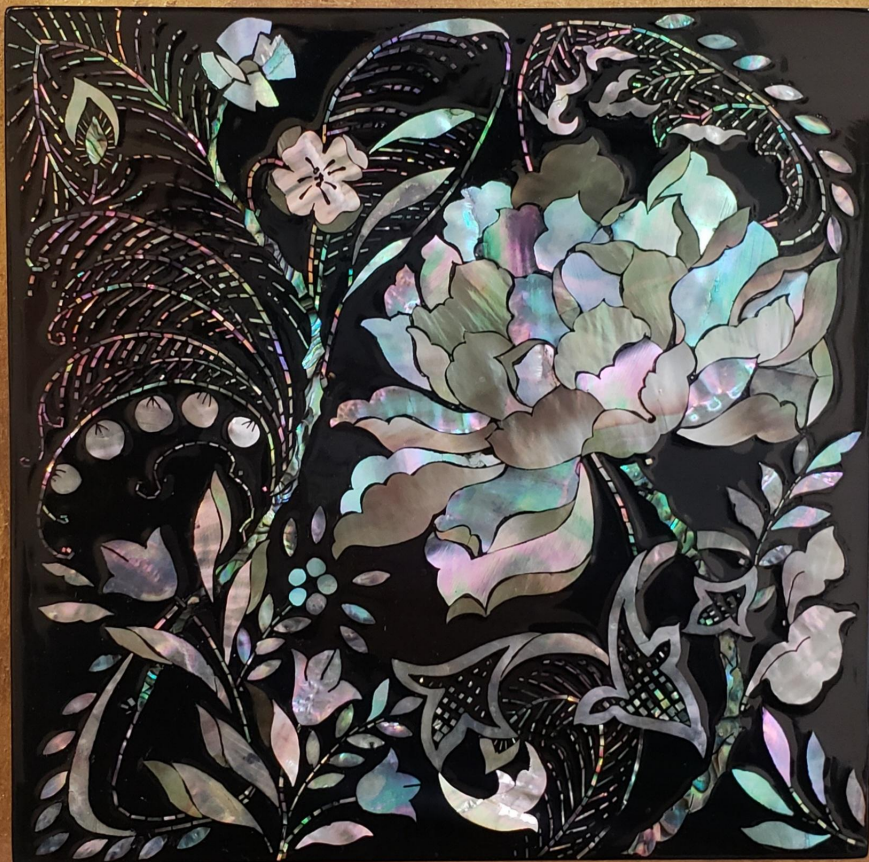
Emma Kim Florals for William Morris with MOP 2019 Lacquer hemp cloth red clay egg shells, Colored lacquer, mother of pearl 6 x 6 inches $1,500