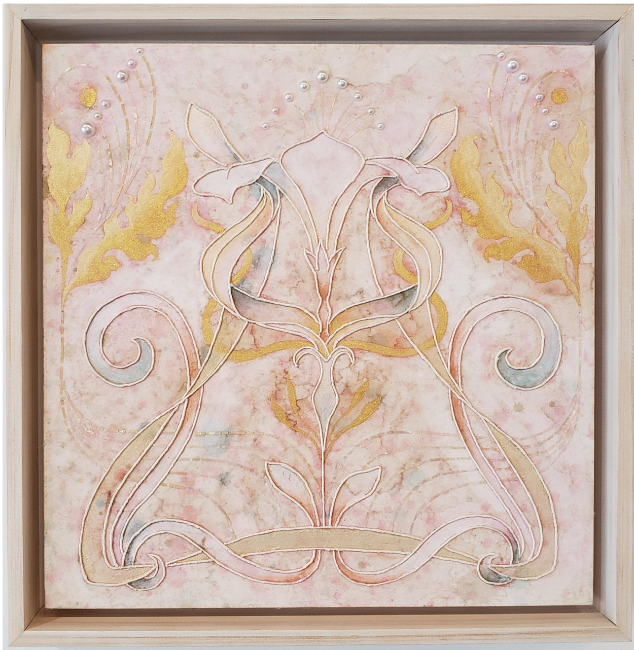
Emma Kim Gold Art Nouveau sm with Mother of Pearl 2021 Korean Pigment with Mother of Pearl On Mulberry paper 12 x 12 inches $480