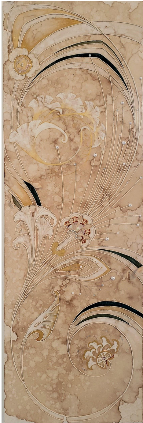
Emma Kim Red Blossom 2021 Korean Pigment with Mother of Pearl On Mulberry paper 12 x 36 inches $1,800