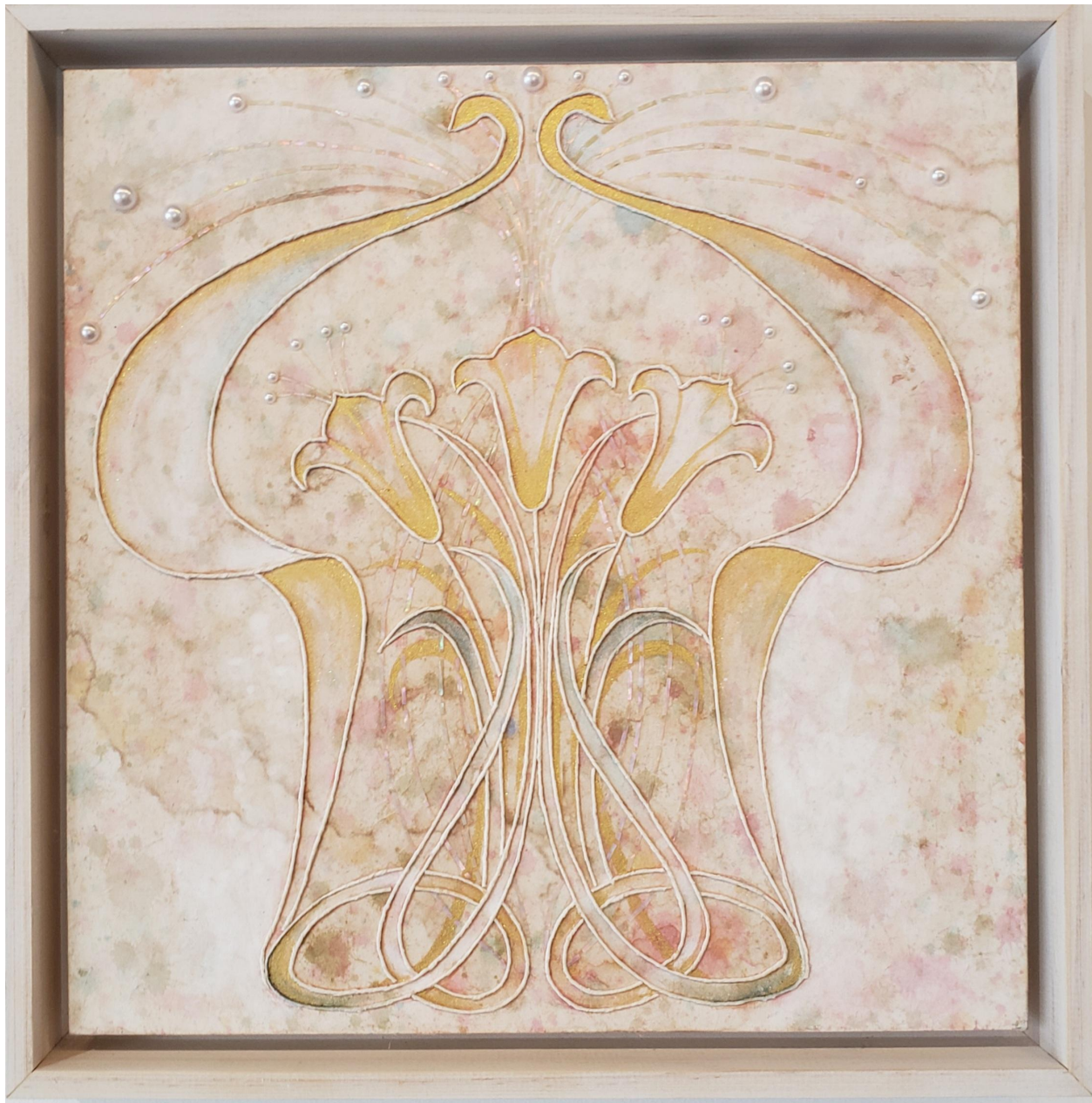
Emma Kim White Art Nouveau 4 with Mother of Pearl 2021 Korean Pigment with Mother of Pearl On Mulberry paper 12 x 12 inches $480