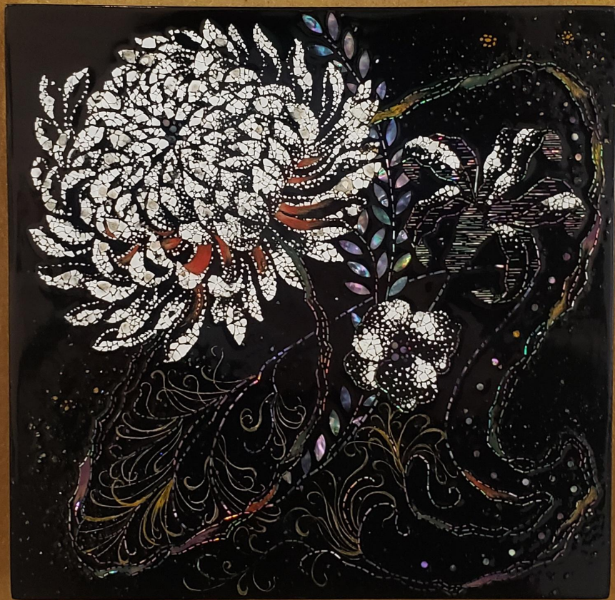
Emma Kim Florals in Art Nouveau With Eggshells 2019 Lacquer hemp cloth red clay egg shells, Colored lacquer, mother of pearl 6 x 6 inches $1,500