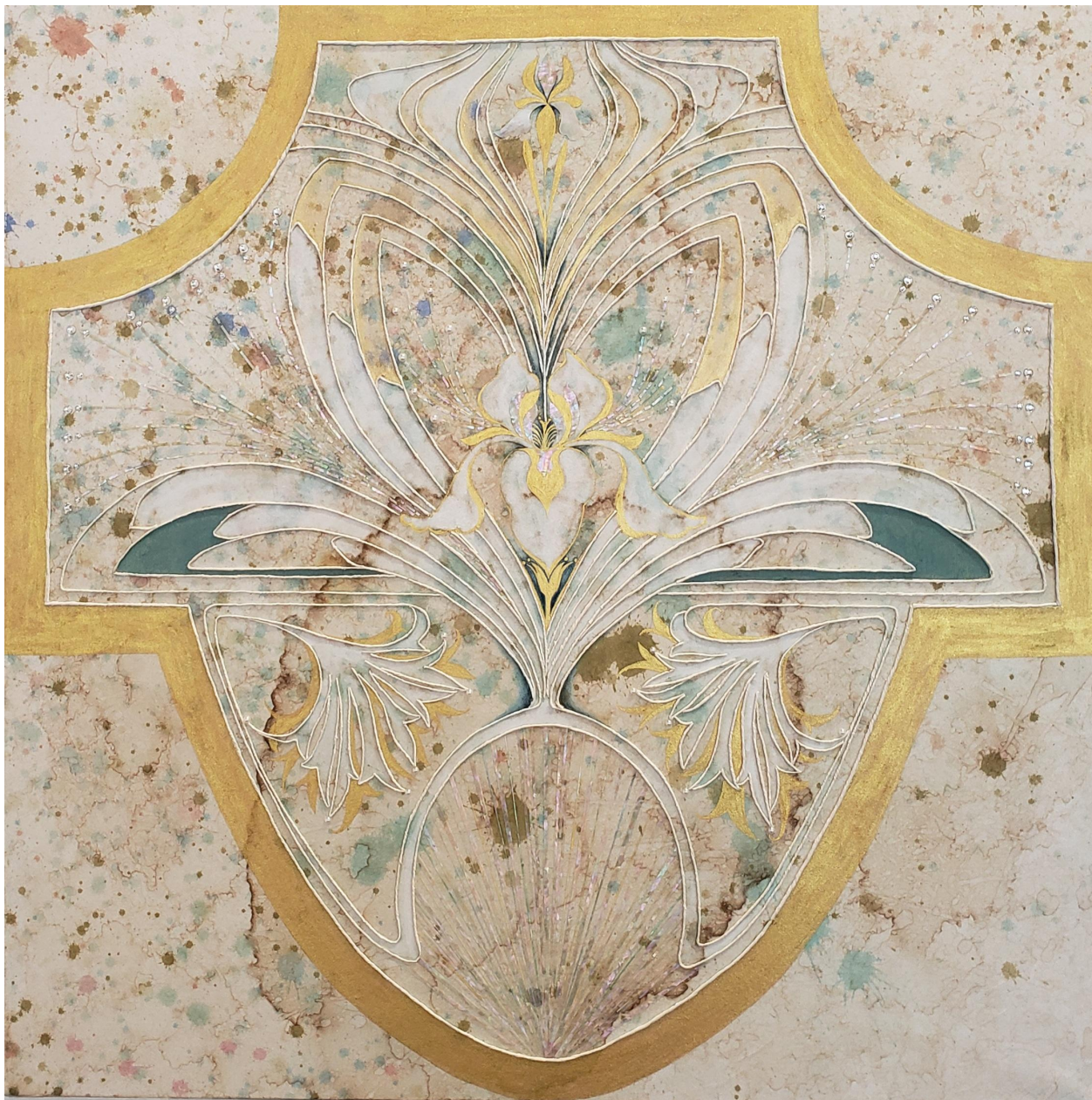
Emma Kim Gold Guard Blue 2021 Korean Pigment with Mother of Pearl On Mulberry paper 24 x 24 inches $2,000