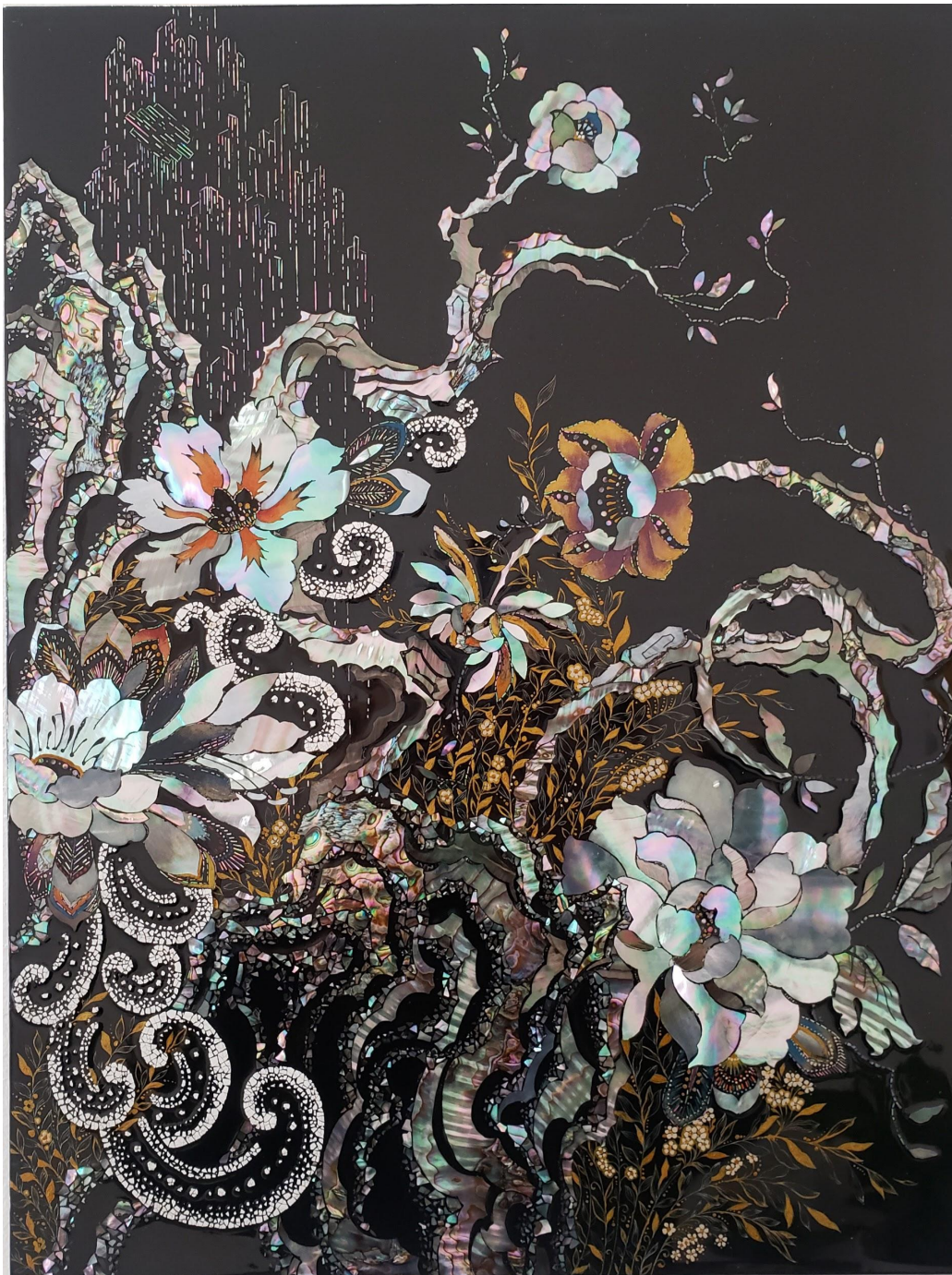
Emma Kim Heaven in my mind 2019 Lacquer hemp cloth red clay egg shells, Colored lacquer, mother of pearl 12 x 16 inches $3,800