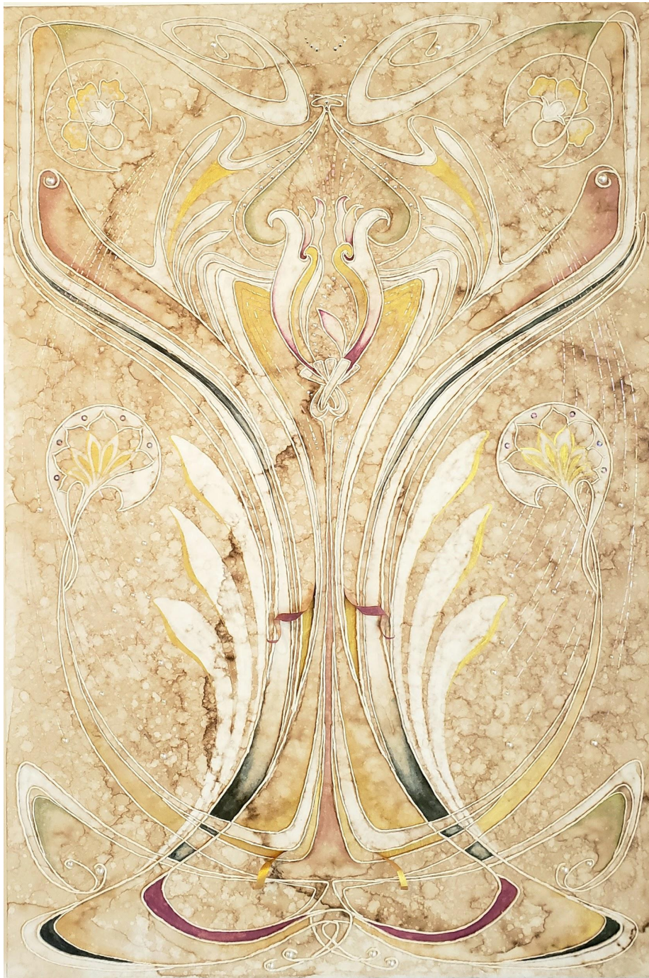
Emma Kim White Blossom 2021 Korean Pigment with Mother of Pearl On Mulberry paper 24 x 36 inches $3,000