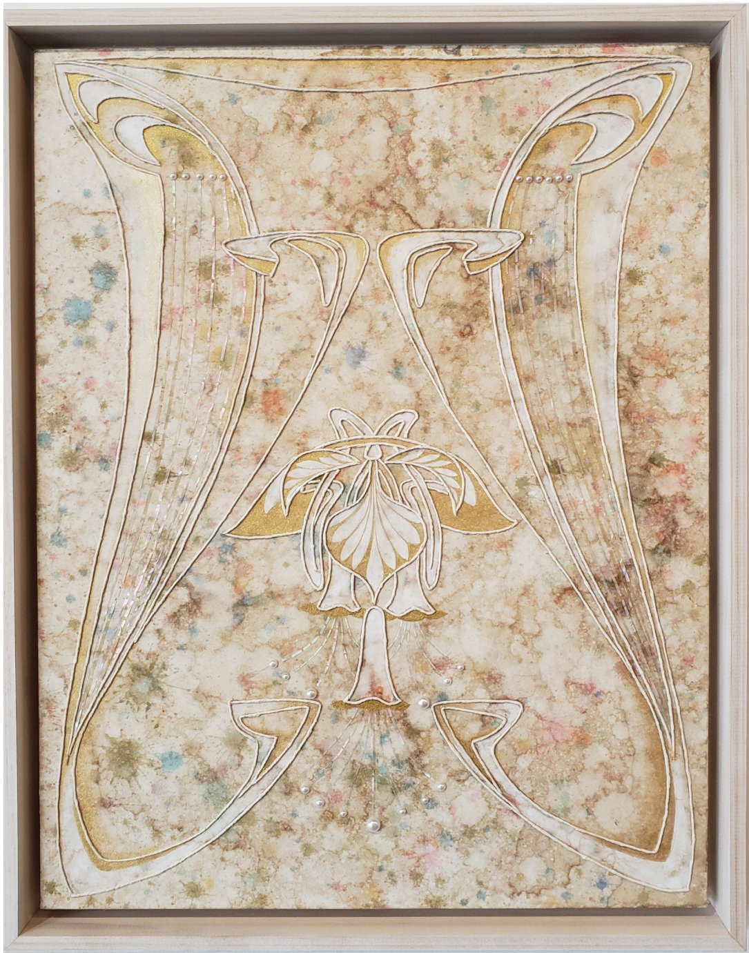
Emma Kim White Art Nouveau 3 with Mother of Pearl 2021 Korean Pigment with Mother of Pearl On Mulberry paper 14 x 18 inches $550