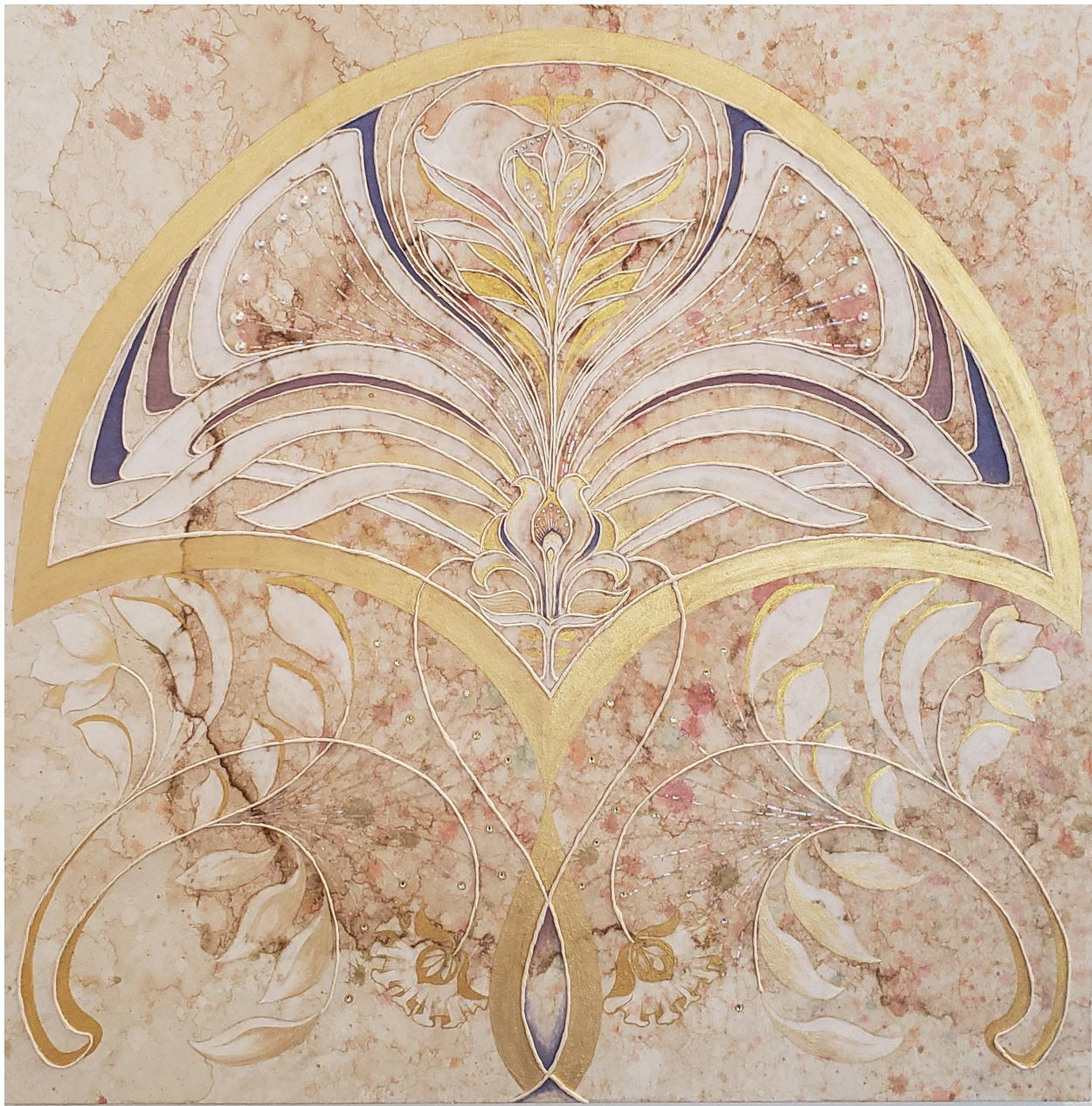
Emma Kim Gold Guard Purple 2021 Korean Pigment with Mother of Pearl On Mulberry paper 24 x 24 inches $2,000