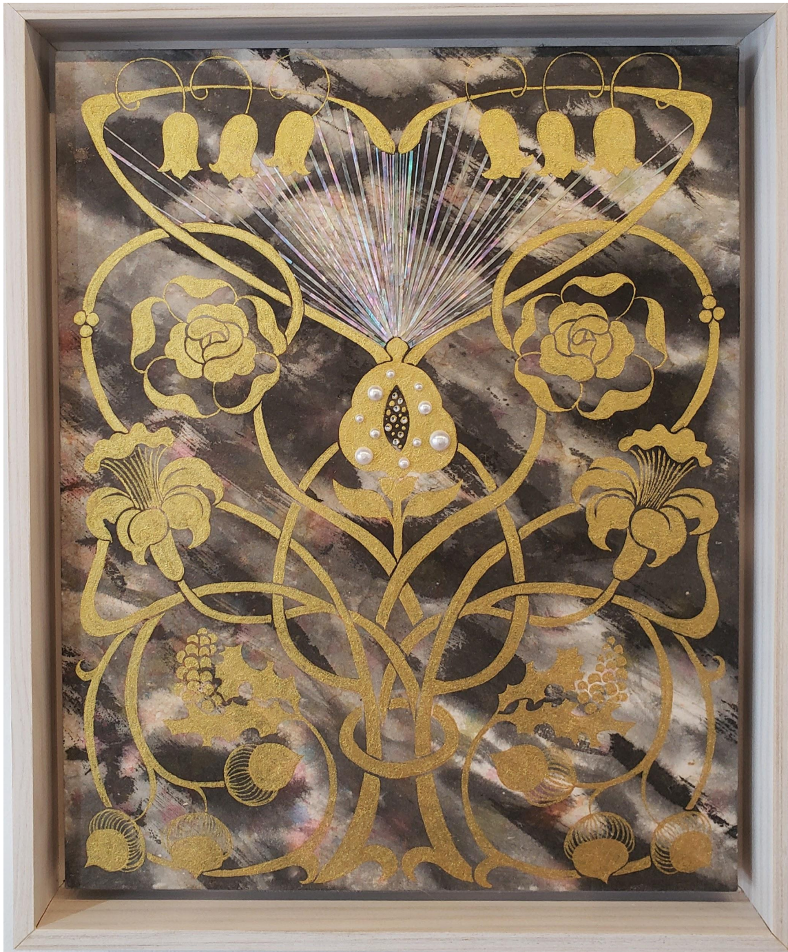
Emma Kim Black Art Nouveau 5 with Mother of Pearl 2021 Korean Pigment with Mother of Pearl On Mulberry paper 11 x 14 inches $520