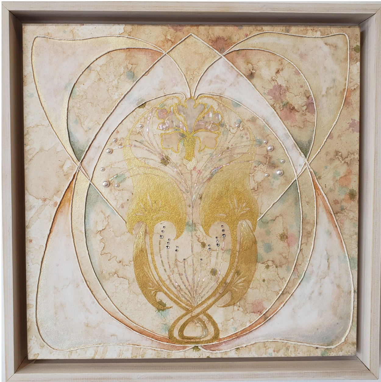
Emma Kim White Art Nouveau 2 with Mother of Pearl 2021 Korean Pigment with Mother of Pearl On Mulberry paper 12 x 12 inches $440