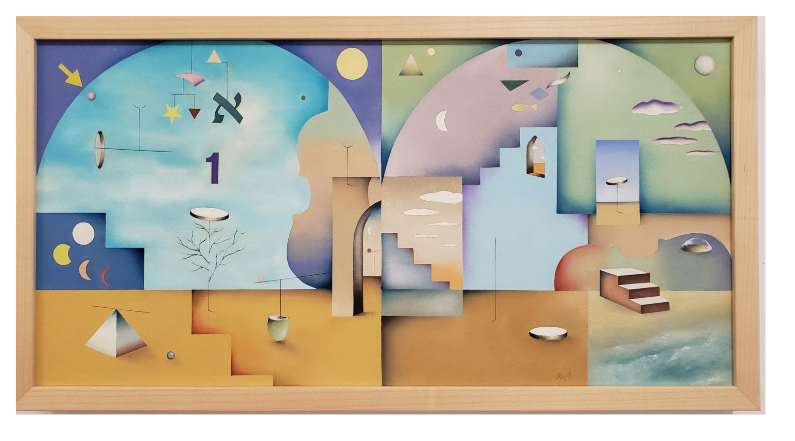
Jeffrey Melzack Koyaanisqatsi, Life Out of Balance , 2019 Oil on canvas, 15 x 30 inches, $2,100